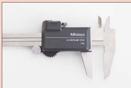
U-WAVE transmitter with buzzer fitted to a Digimatic caliper.